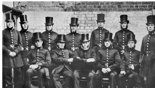
A 19th century police force.